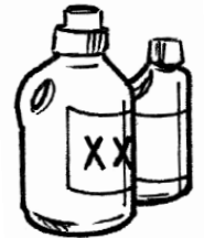
Bleach and Detergents